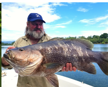
PAPUAN BLACK BASS